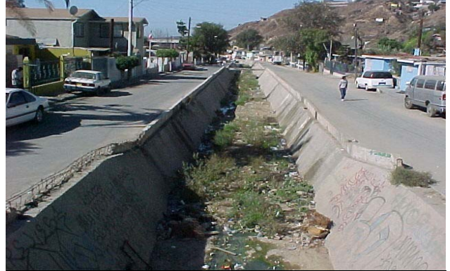
A channel like this one will extend the entire length of Cañon Los Laureles to protect residents from flash floods, but will increase the flow of storm water drainage to the U.S. side of the border.

The Tijuana River Watershed is binational – with two-thirds located on the Mexican side of the border. Cañon Los Laureles is