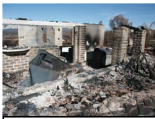
A burned house in Las Minas

The recent fires across San Diego were devastating resulting in the loss of over 2,574 homes and 16 lives. As international attention focused on the tragedy in Southern California what was overlooked by many was the 40 or so families in Ensenada that lost all their personal belongings to the wildfires that swept through