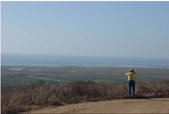
View of the wetlands from atop a mesa in Border Field State Park that have been negatively impacted by the runoff from Tijuana’s Cañon Los Laureles .

In spite of the pressure to move quickly, the municipal government in Tijuana has been very willing to discuss project alternatives that would reduce the impacts on TRNERR, especially in Border Field State Park, which has over four feet of sediment and trash on its roads each year. This willingness opened the door for U.S. and Mexican agencies and non-profit organizations to collaborate on potential solutions.