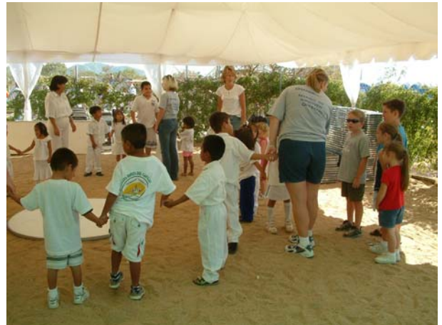
Above: ULR employees playing with children at Los Niños del Capitán Below: ULR employees helping pour cement for medical clinic