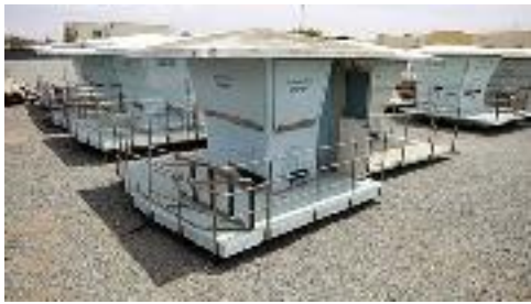
Sixteen donated lifeguard towers are stranded in a storage yard near the Otay Mesa border crossing until they can clear Mexican customs.

But that is turning out to be the easy part. The biggest hurdle has been getting approval from Mexican customs. Two weeks after they were set to cross the border, the structures remain locked in an Otay Mesa storage yard.