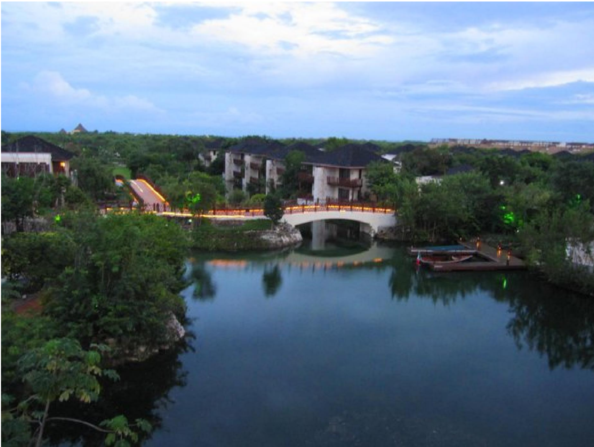
- FAIRMONT MAYAKOBA

The Fairmont Mayakoba is a hotel complex with a planned expansion that would include condos. The complex, on the Yucatan Peninsula in eastern Mexico, has native vegetation around it, including mangrove areas.